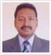
The Jewellery Emporium Contribution: Rs. 50,000