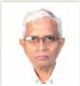
Ganjam Nagappa & Son Pvt Ltd Contribution: Rs. 50,000