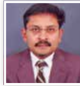
Shankaranarayan Jewellers Contribution: Rs. 10,001