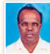
Chowlur Jewellers Contribution: Rs. 7,777.77