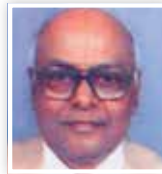
Sri Gurukrupa Jewellers Contribution: Rs. 10,001