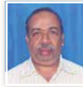
T.A Padmanabhaiah Setty & Sons Contribution: Rs. 25,501