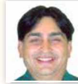
A.B.Gold Pvt Ltd Contribution: Rs. 5,00,000