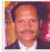
Geetha Jewells Contribution: Rs. 25,000