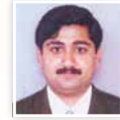
M.R.K Jewellers Contribution: Rs. 61,000