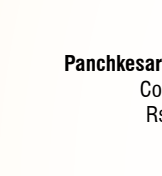
Panchkesari Badera Jewellers Contribution: Rs. 25,000