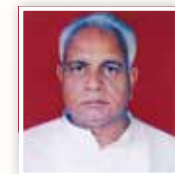
Mahendra Diamond & Jewellers Contribution: Rs.51,000