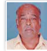
Raghu Jewellers Contribution: Rs. 5,001