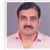
J.J.J Jewellers Pvt Ltd Contribution: Rs.51,000