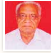
Jaysons & Co Contribution: Rs. 25,000