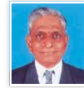
Sree Rama Jewels Contribution: Rs. 20,000