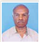
N.R.Satyanarayana Setty & Son Contribution: Rs. 10,001