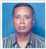
Diamond Facets Contribution: Rs. 10,001