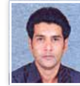
Nakoda Jewellers Contribution: Rs. 5,001