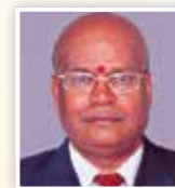
Jayalakshmi & Co Contribution: Rs. 7,000