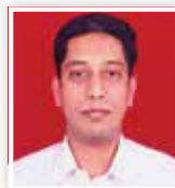
Jwalamala Jewellers Contribution: Rs. 10,000