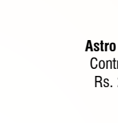
Astro Journey Contribution: Rs. 25,001