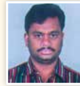
Namboor Jewellers Contribution: Rs. 25,000