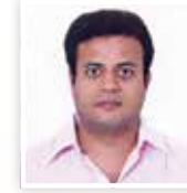
Abharan Jewellers Contribution: Rs. 11,000