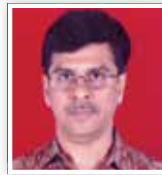
Annapurna Jewellery Mart Contribution: Rs. 10,000