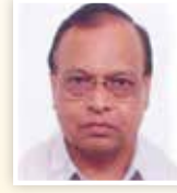
Sri Gurukrupa Jewellery House Contribution: Rs. 25,000