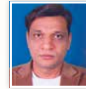
Sri Kothari Jewellers Contribution: Rs. 25,000