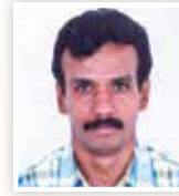
Shreya Jewellers Contribution: Rs. 25,000