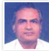
Bangalore Refinery Pvt Ltd Contribution: Rs. 25,000