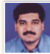
Nikhaar Jewels Pvt Ltd Contribution: Rs. 25,000