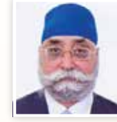
Neelkanth Jewellers Contribution: Rs. 11,000