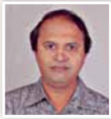
Rajashree Jewellers Contribution: Rs. 10,116