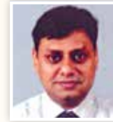
Peakok Jewellery Ltd Contribution: Rs. 10,000