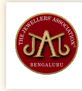
The Jewellers Association Contribution: Rs.10,00,000