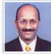
Chetana Jewellers Contribution: Rs. 25,000