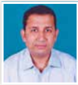
Balaji Exports Contribution: Rs. 10,001