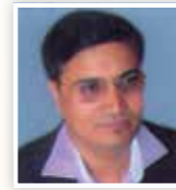
J.K.S Jewels Pvt Ltd Contribution: Rs. 1,51,000