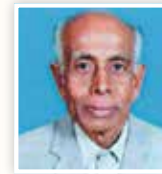
Sharada Silver Chain Factory Contribution: Rs. 10,000