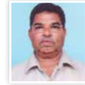
Savithri Jewellers Pvt Ltd Contribution: Rs. 55,000