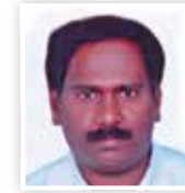
Vaibhav Jewellers Contribution: Rs. 25,000