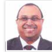
C. Krishnaiah Chetty Foundation Contribution: Rs.51,000