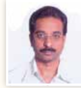
Sree Ranganatha Jewellers Contribution: Rs. 25,000