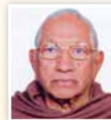
Prathibha Jewellery House Contribution: Rs. 75,000