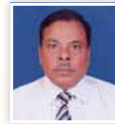
Vivek Jewellers Contribution: Rs. 10,000