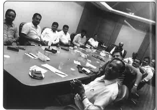
Akshaya Thritiya Meet