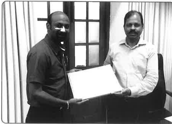
Meeting with Chief Secretary of GOK to submit memorandum on GST Issues