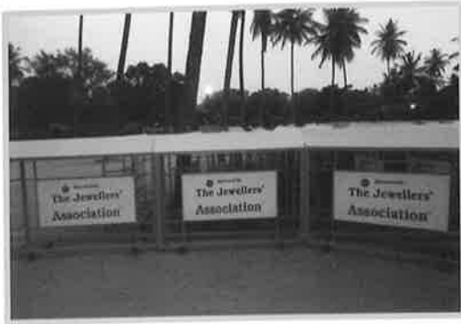
Donated 15 Barricades to Chickpet Police Station