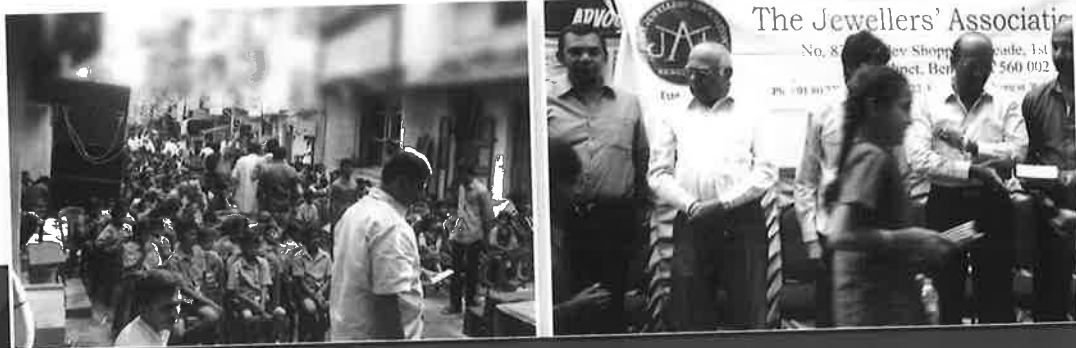
Note book distribution – About 2300 books were distributed to about 500 deserving school students at C.T. Street.