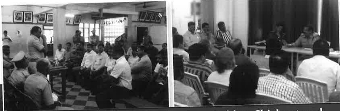
The Police Committee Meeting was held at Chickpet and Upparpet Police Station to discuss adequate measures to be taken for safety & security and prevention to be taken to avoid crimes.