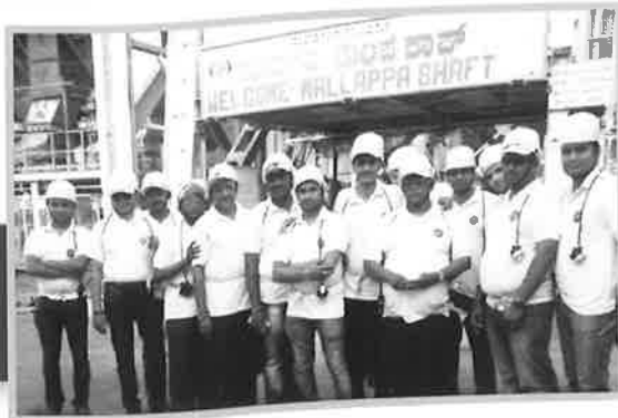
JAB arranged a Hutti Gold Mine trip for JAB members. 15 members visited the Hutti Gold Mine.