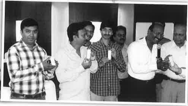
Silver Standard (99 Fine) Launch