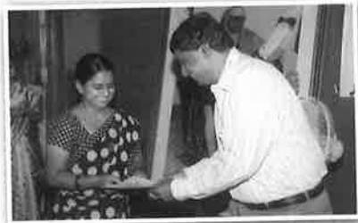
JSS Workshop on Export of Gold Jewellery