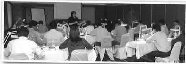
GIA's Diamond Grading Lab Class (Class Session)