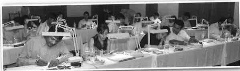
GIA's Diamond Grading Lab Class (Lab Session)