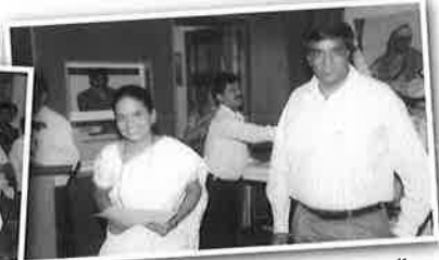
JSS Workshop on Export of Gold Jewellery