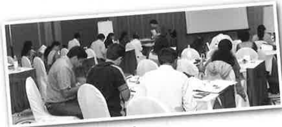
GIA's Accredited Jewellers Program