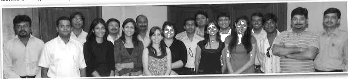
GIA's Diamond Grading Lab Class (Faculty-Participants)